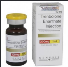
Buy Trenbolin (vial)